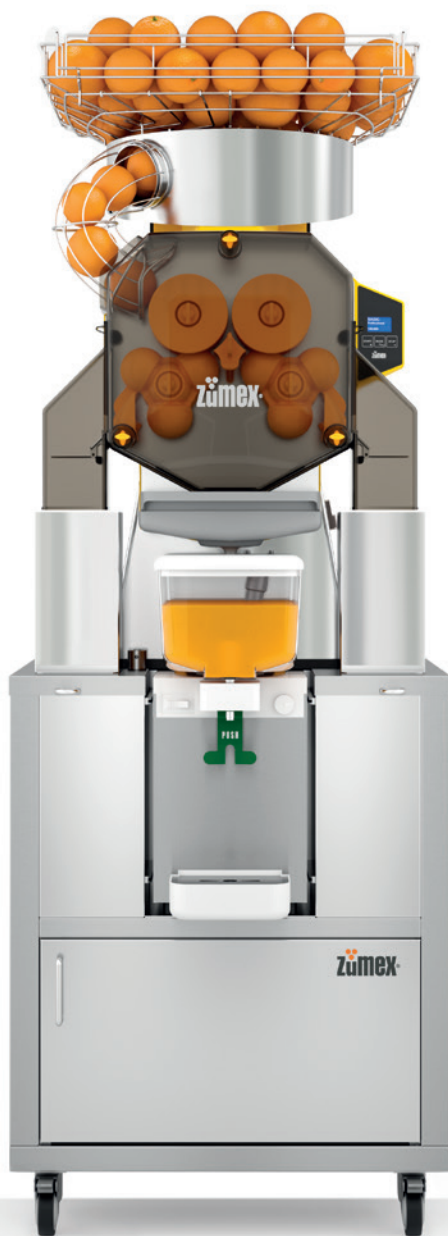
Speed Pro Cooler Podium