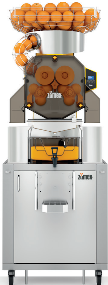
Speed Pro Tank Podium