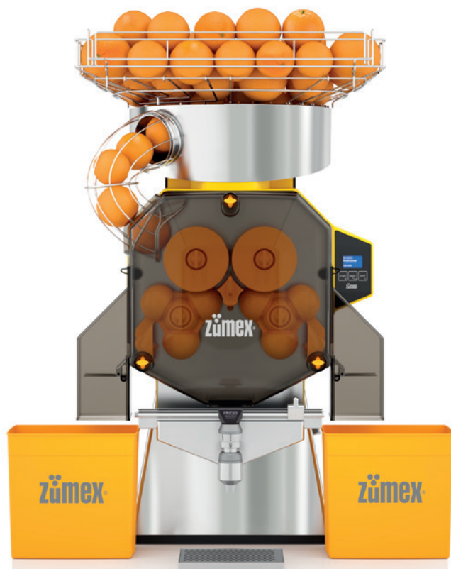
Speed Pro Self Service