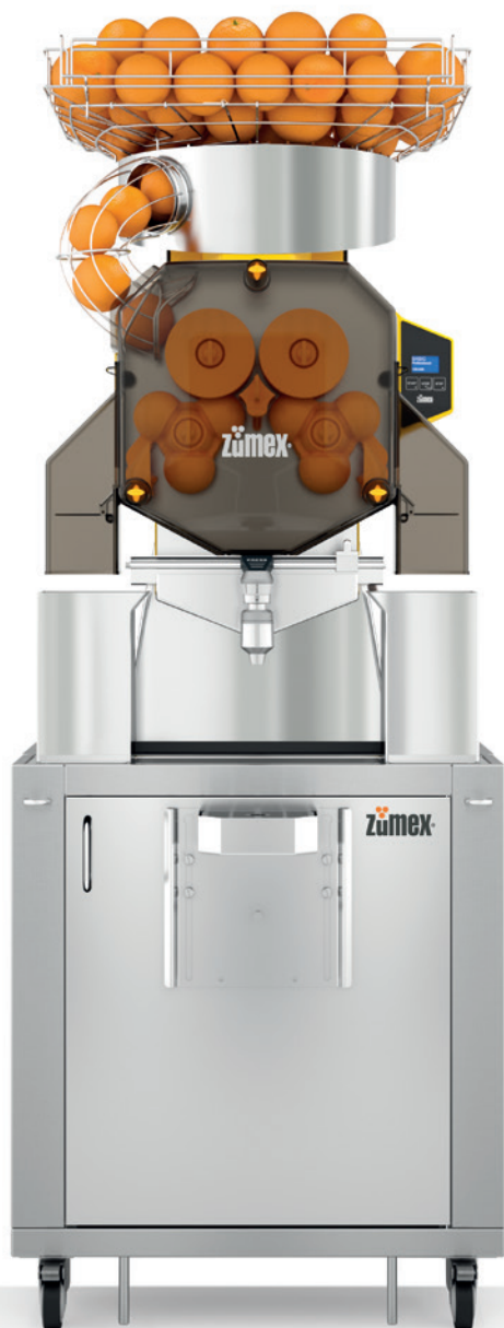
Speed Pro Self Service Podium